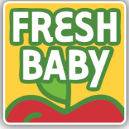
Table 12 – Fresh Baby, LLC.

Texas Association of City & County Health Officials