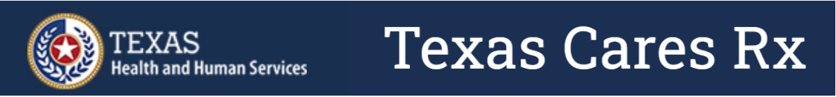
Table 15 – HHSC – Texas Cares RX Program

Texas Association of City & County Health Officials