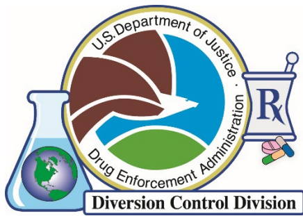
Table 14 - U.S. Department of Justice/DEA Division